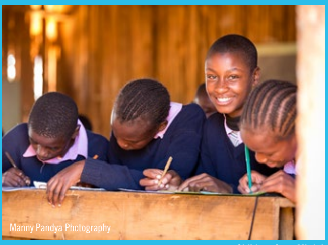
Children from Mbtini

Anne continued, "The availability of water encourages children to attend school more because they are sure of clean drinking water."