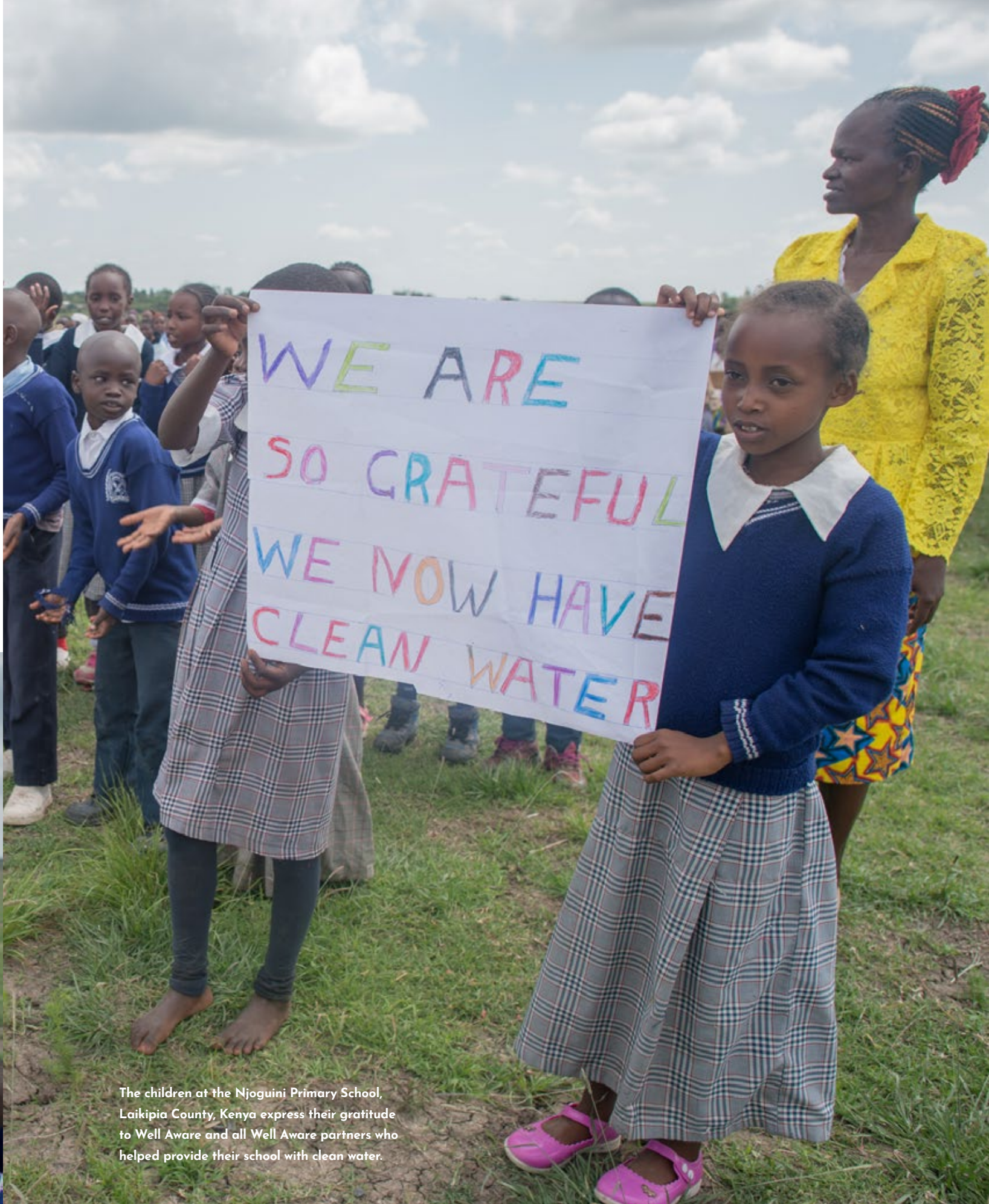
The children at the Njoguini Primary School, Laikipia County, Kenya express their gratitude to Well Aware and all Well Aware partners who helped provide their school with clean water.